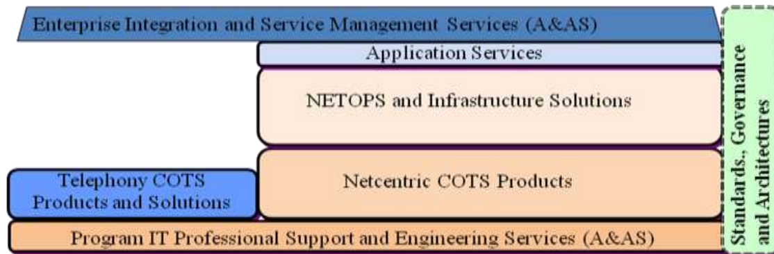
Figure 1. Relationship of Contract Areas

The NETCENTS-2 contracts enable the delivery of products, services and solutions that adhere to the AF Enterprise Architecture (AF EA) and complement each other as depicted in Figure 1.