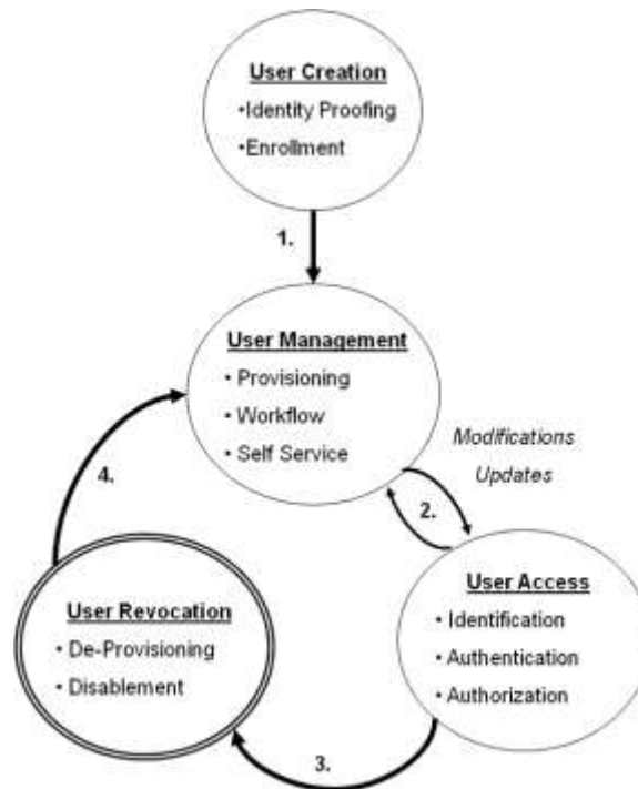
Figure 2: Enterprise Entity Lifecycle